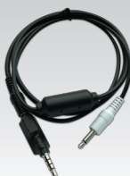
OPT-1x IR Adapter Cable