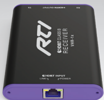
VHR-1x HDBaseT Class B Receiver