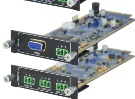
Microphone In/Out Card