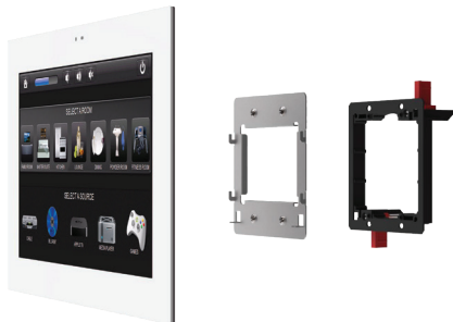
On-wall installation uses two-gang wall bracket & adapter