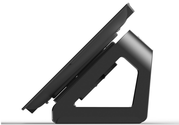
The Tabletop Stand is sold separately