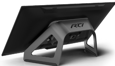
Countertop installation with accessory table stand