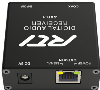
AXR-1 Receiver Input View