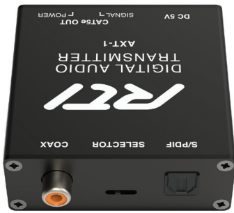
AXT-1 Transmitter Input View

Distributing digital audio over long distances can be problematic. The AXP-1 Digital Audio Extender Kit uses a standard Cat5e/6 cable to seamlessly transmit S/PDIF (Toslink) audio over 650 ft (200m).