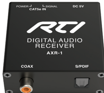
AXR-1 Receiver Output View