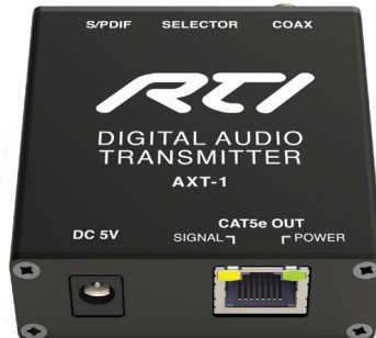
AXT-1 Transmitter Output View